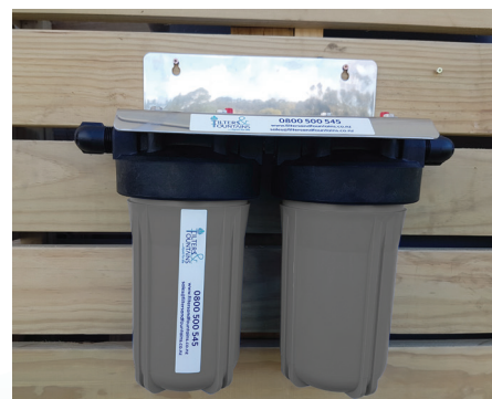
Now with stainless steel bracket