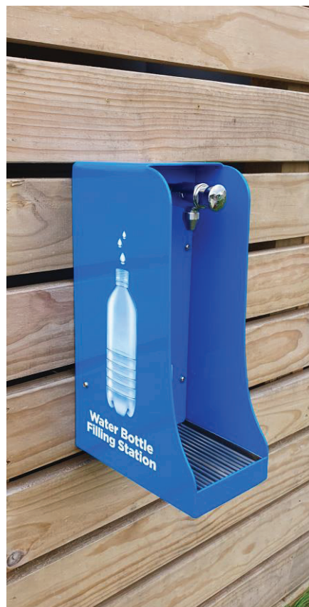
Plate or concrete in ground mounting stand Powder coat colour choices Personalised school or company wraps available. Dimensions: 470 mm high x 160 mm wide x 270 mm deep.